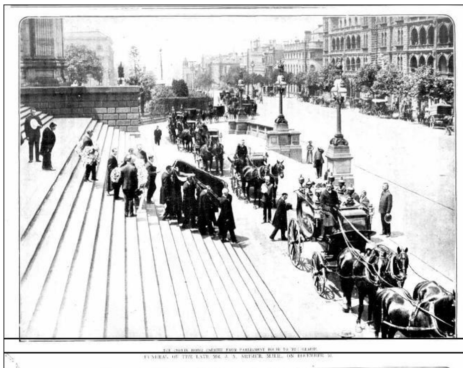
The Australasian , Saturday 19 December 1914, page 55